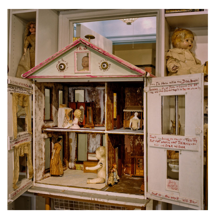
A dollhouse in Gloria's art studio. She scribbled narrative and poetry on its little walls, including "I am still living in a doll's house."