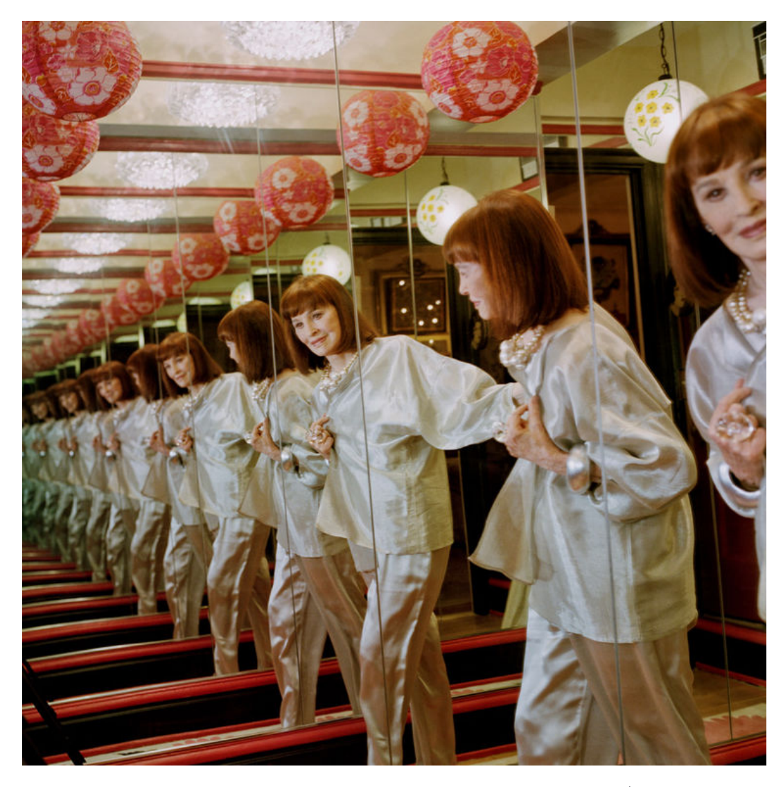
The infinite hall of mirrors leading to Gloria Vanderbilt's bedroom in her Manhattan house, 2011.