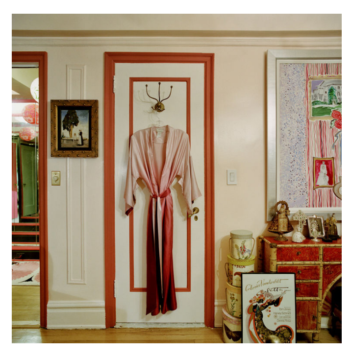
In the boudoir, Gloria's negligée hangs next to Pictures on a Bedroom Wall, a family scene reflective of her own, which she painted in 1975.