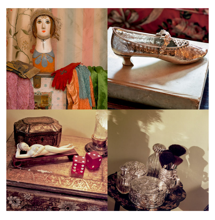
Vignettes of Gloria's house include a silver toilette and slipper from the family silver collection and a Chinese tea caddy and ivory figurine.