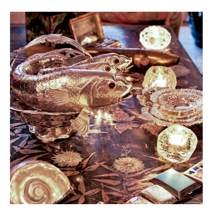
More from the family silver collec on: a trio of sh rests on a lacquered papier-mâché sofa table.